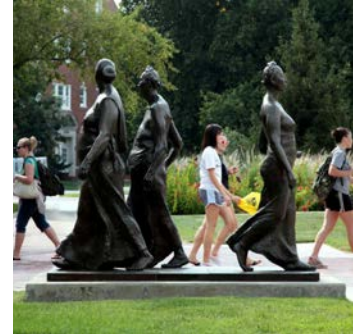
Tres Mujeres Caminando (Three Women Walking), 1981 Francisco Zuñiga