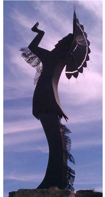
The Keeper of the Plains Blackbear Bosin, 1974

Steckline Gallery at Newman University 3100 McCormick Street www.newmanu.edu/stecklinegallery